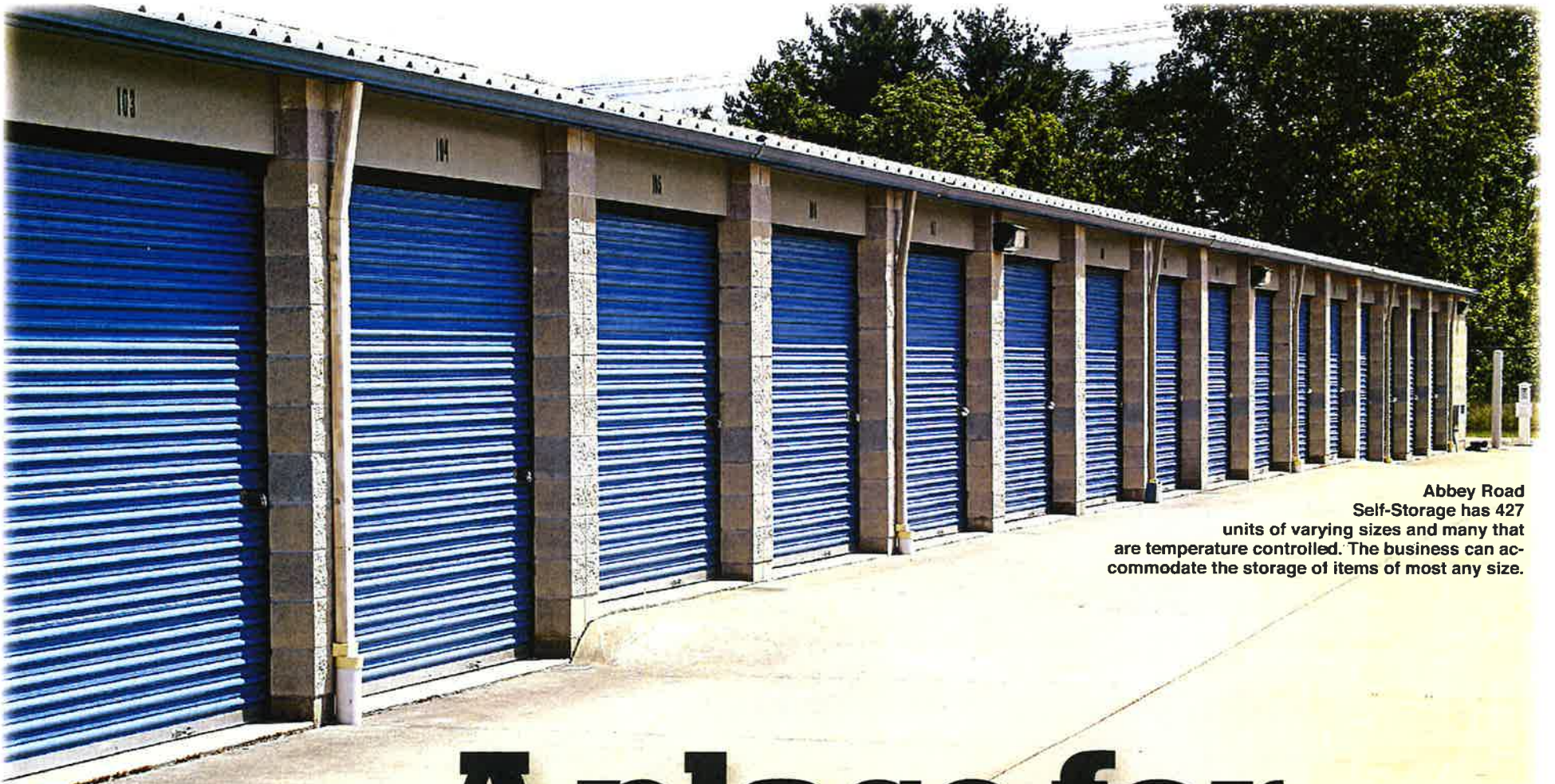
Abbey Road Self-Storage has 427 units of varying sizes and many that are temperature controlled. The business can accommodate the storage of items of most any size.

• Voted America's best free newspaper • Saturday, June 16, 2012